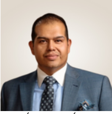
CÉSAR CHÁVEZ (DEMOCRAT)