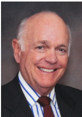
DENNIS DECONCINI, FORMER UNITED STATES SENATOR, TUCSON (D)

It has been my experience when it comes to politics, that most Arizonans cannot be easily labeled or defined. We are an independent bunch. We don’t like extremism, preferring to work things out for the common good.